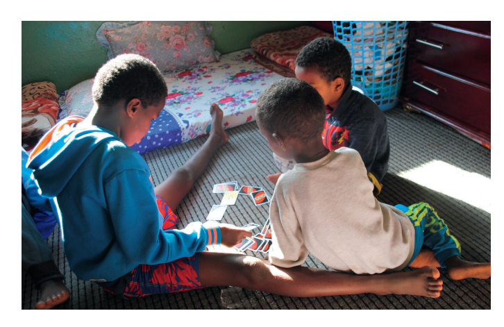
Be a Co-Sponsor

If the sponsorship amount is out of reach for you but you want to join Team Tesfa and change a child's life, here are some ideas to consider: