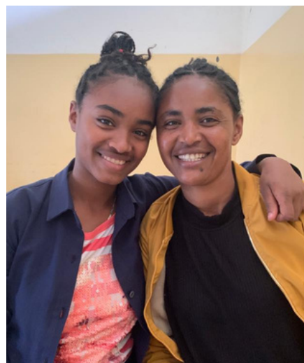
PAGE 10 | A SISTER PROJECT