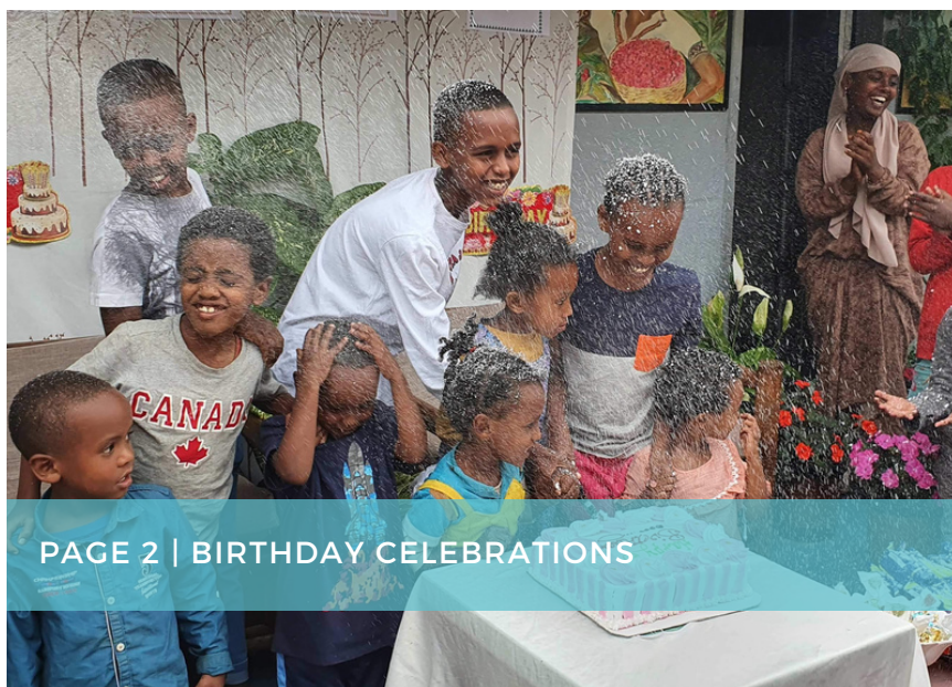
PAGE 2 | BIRTHDAY CELEBRATIONS