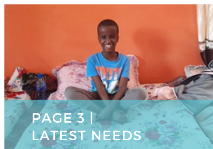
PAGE 3 | LATEST NEEDS